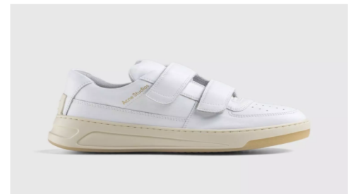
Perey Velcro Strap Sneake Acne Studios