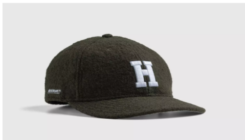
59FIFTY Highsnobiety x New Era