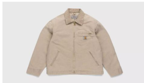
Detroit Jacket Carhartt WIP