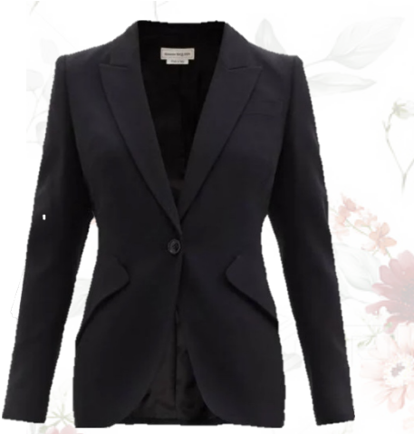
Alexander McQueen Peak Shoulder Leaf Crepe Jacket in Black, $1,995