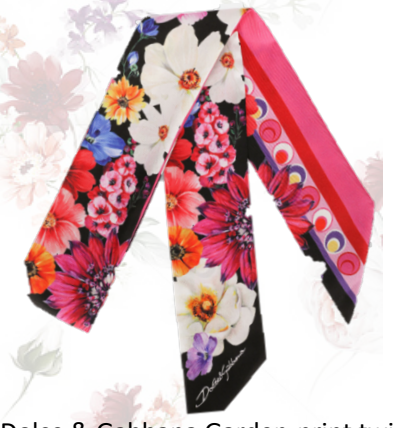
Dolce & Gabbana Garden-print twill