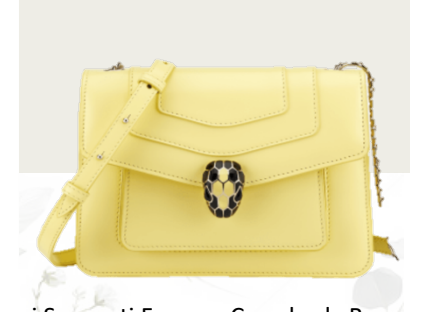
Bylgari Serpenti Forever Crossbody Bag, $2,600